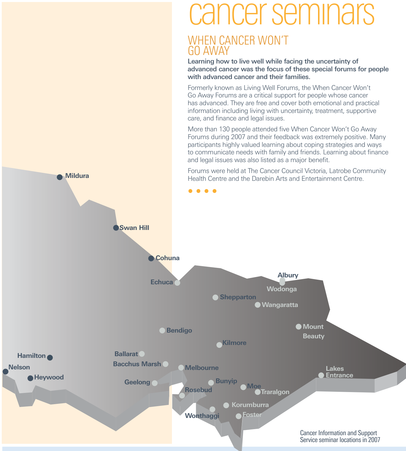
Cancer Information and Support Service seminar locations in 2007